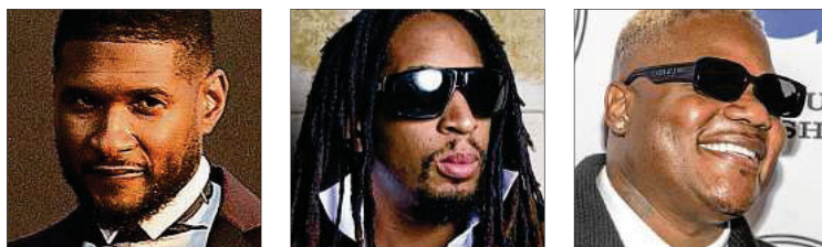
Usher (from left), Atlanta-based rapper Lil Jon and songwriter and producer Sean Garrett collaborate on "GLU," Usher's first solo single in three years.

Usher's legacy is frequently debated online as if he isn't one of the bestselling R&B artists of this century. Social media constantly pits him in a hypothetical Verzuz battle against his predecessor R. Kelly and Chris Brown, whom he almost mentored. Usher has more hits and has sold more records than both. And