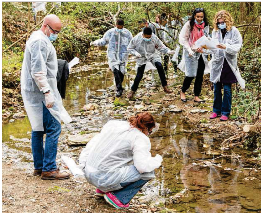
ABOVE: The Atlanta Science Festival continues through Saturday and will include geology, robotics and the cultivation of insects for food.