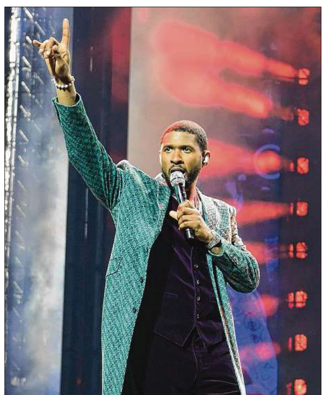
Grammy-winning singer Usher, who released his new single “GLU” on Friday, is shown performing in Las Vegas in 2022. The artist is also working on an album and his own record label.