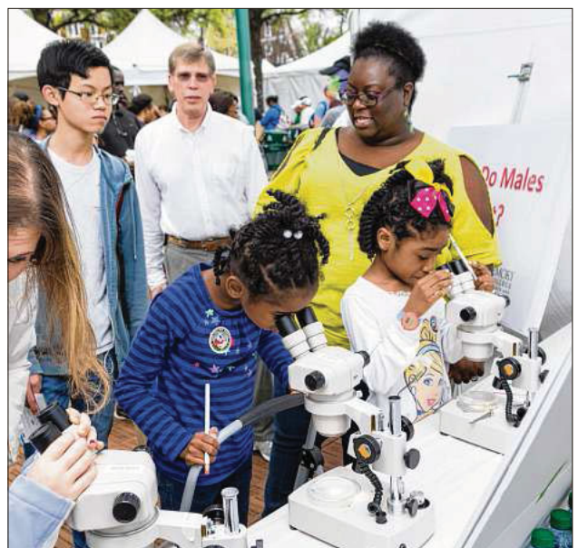
Get a closer look at the microscopic world at the Atlanta Science Festival, where you can also meet reptiles, make moon rocks and lava lamps and print 3D images of your own bones.

There are events aimed at adults, too, including “Jazz Hands: A Science Comedy Event.” The festival’s brochure asserts that “because we’re scientists, we’ve got data to back that statement up.” This event, at 7:30 p.m. Tuesday at the World Studio at Zoo Atlanta, is for people age 21 and up.