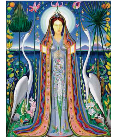
"Purissima" (1927) by Joseph Stella.